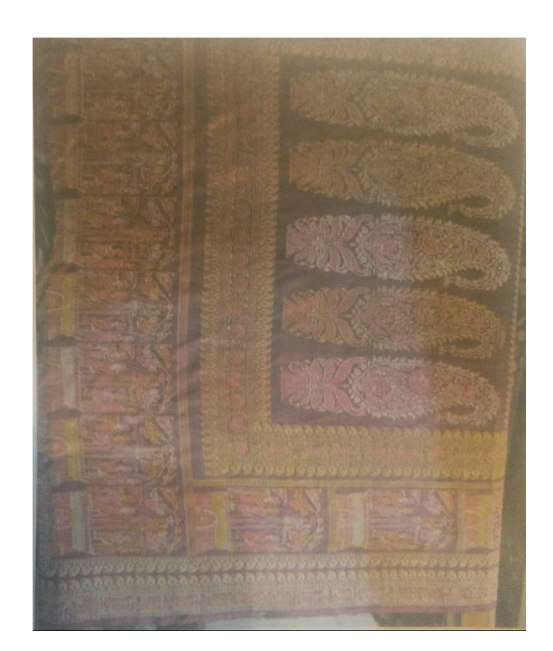
Q.11 (a) Name the different types of carpets produced in India?

Ans 10: The pallu of the Baluchari sari is special as it is divided into niches bordering a square or rectangular space in the center. In each of the niches a human figure is depicted, normally a king smoking a hookah. A row of three, Five or Seven ornate paisley are seen in the centre of the pallu, around which niches with human figures are woven. The Baluchari saris are often rekoned with the pattering of sun, moon, stars, mythical, scenes and motifs of natural objects.